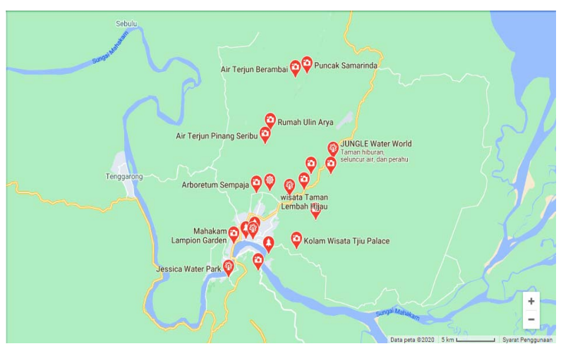
Figure 2. Map of tourist attractions in Samarinda